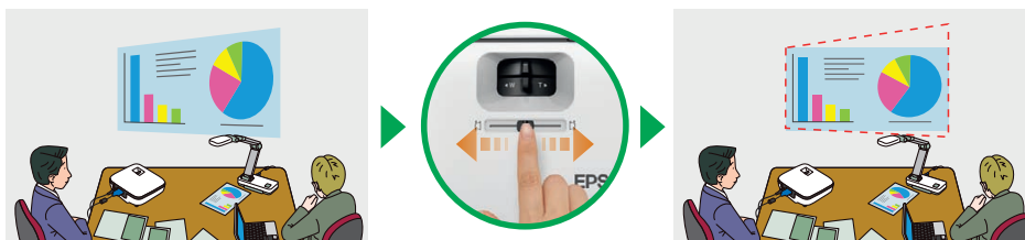
Horizontal Keystone Correction Adjuster: This intuitive new slider lets you adjust images to the correct shape when the projector is at an angle to the screen

Eliminate the need for photocopies: share 3D objects using the ELPDC06 visualiser